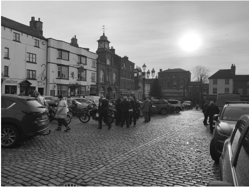
The Winter SUNSHINE is just coming out on this very cold first morning of 2026.

On the first day of 2026 we riding over the Derbyshire Peak District to the Staffordshire Moorlands to the "Queen of the Moorlands" the market Town of Leek. The meeting is organised by the Vintage MCC, and from the market place there is a ride out to Wetton Mill for a second meet.