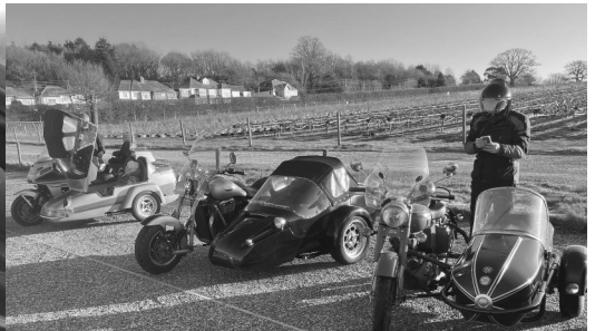
...to the Strawberry Cabin

The breakfast orders reflected the different views people had as to whether new year resolutions had started or not. The fact only one full English breakfast was ordered indicated to me that most of our group had already started them. I suspect Vera was the healthiest with the order of Porridge, but I couldn't say whether the Omelette or crushed Avocado came second.