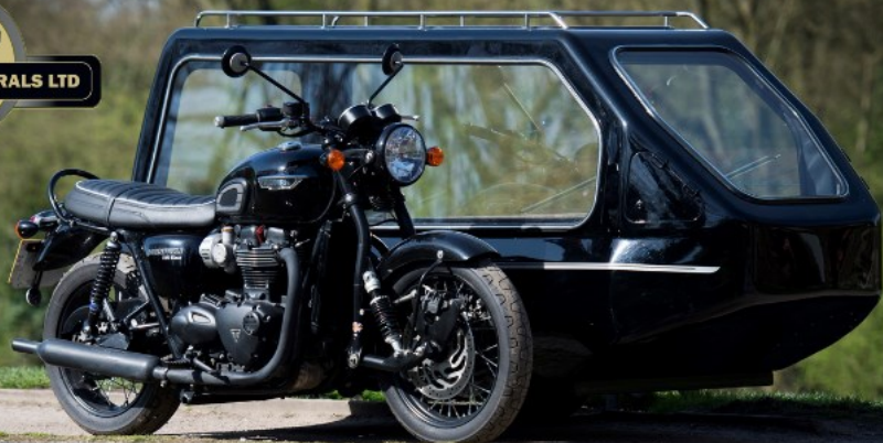
Triumph Bonneville - The quintessential British motorcycle and sidecar hearse