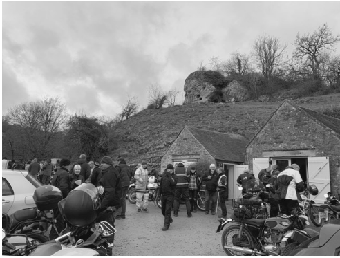
The cafe was providing sustenance for the cold riders.