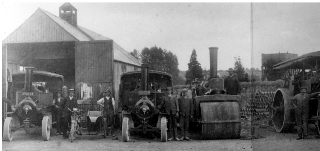
Thornbury Council Depot. From the Thornbury and District museum— Paul Martyn