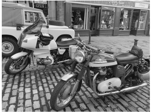
Norton, Airhead and Land Rover which are three true classics