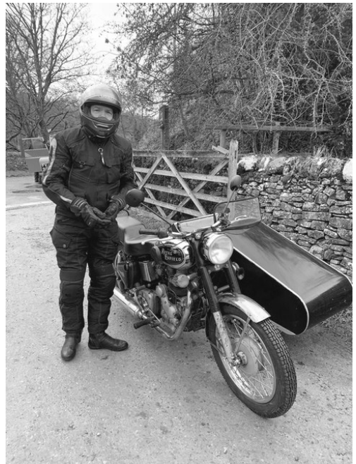
Its a COLD looking RE sidecar rider from Coalville