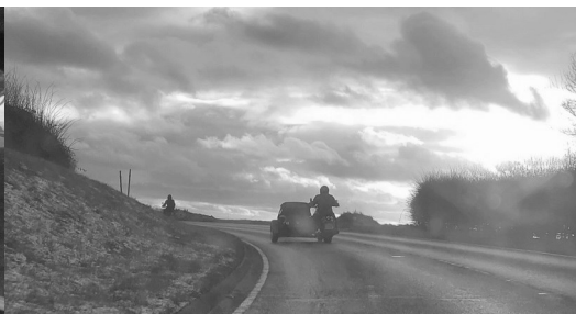
To the setting sun