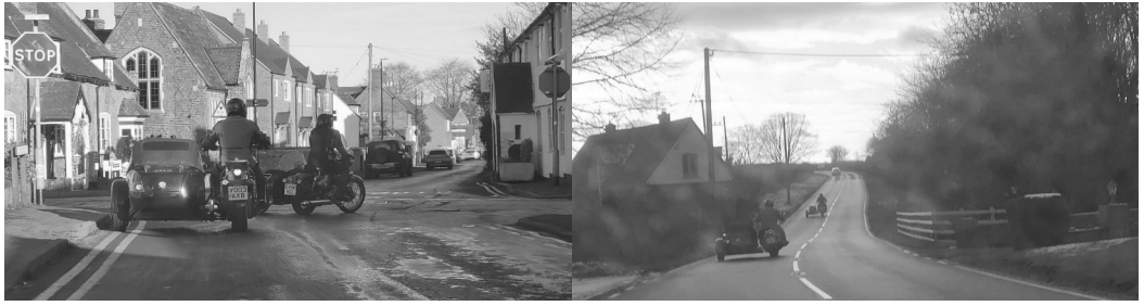
More shots from the Chair