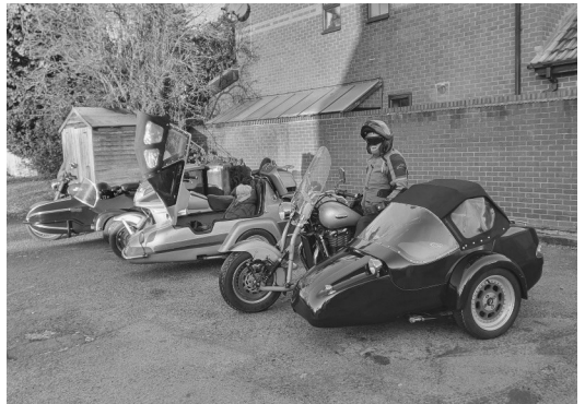
All arrived at the Railway on schedule