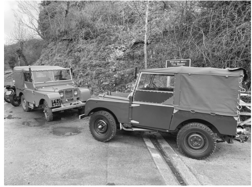
Also the Land Rover Club had come out to play also.

Bye for now on the first day of 2026 in the Manifold Valley,