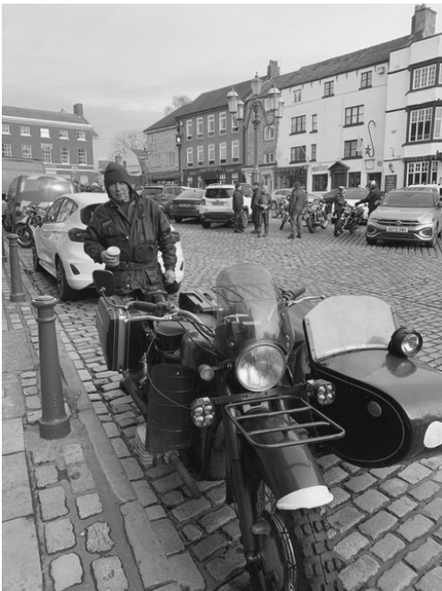
The local Dnepr sidecar owner with his coffee from the Costa Coffee.