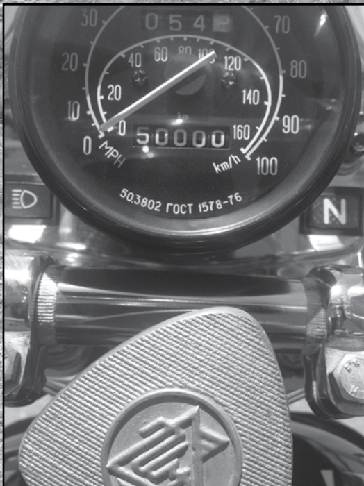
2006 Ural Tourist reaches milestone