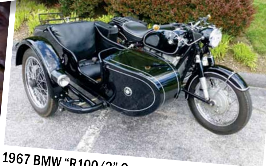
1967 BMW "R100/2" Conversion w/Ural Sidecar