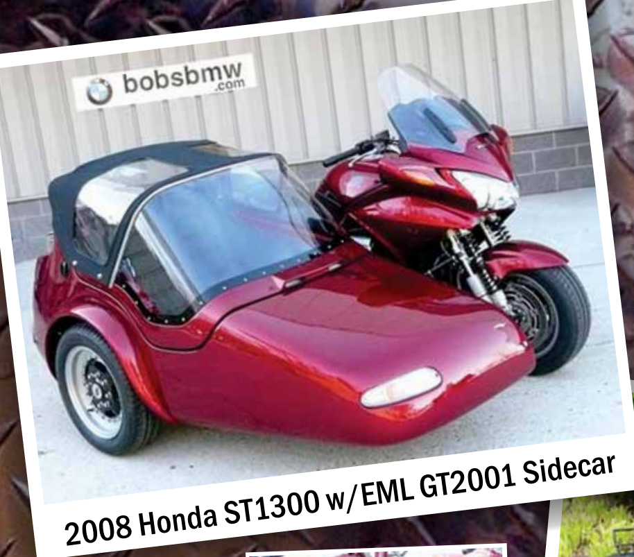
2008 Honda ST1300 w/EML GT2001 Sidecar