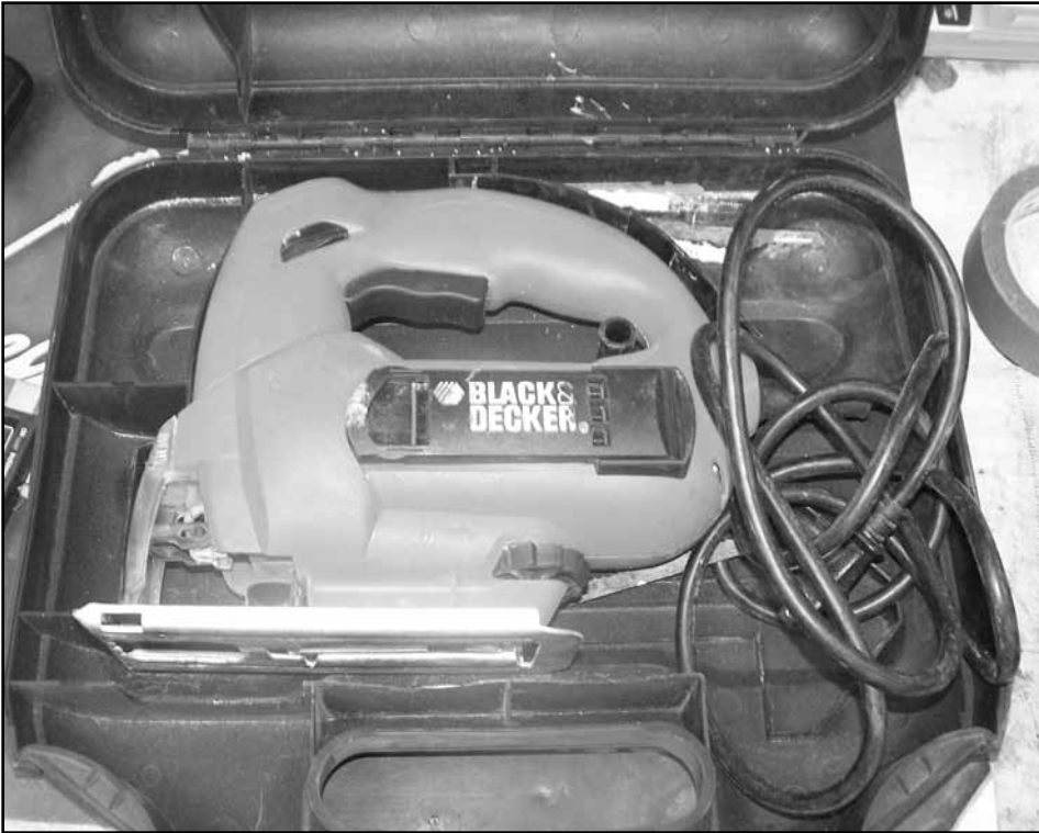
Pic 3 (left) is of my trusty scroll saw, hand-held type one each.